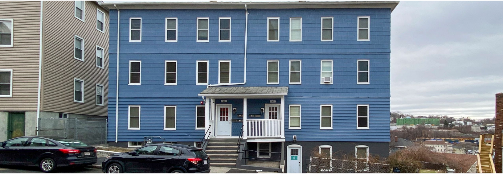
Owner: Sustainable Comfort, Inc. | Location: Worcester, MA | Completion Date: 2019

This renovation project fully restored 7 units in one of the most walkable neighborhoods in Worcester. Each unit received new modern style, eat in kitchens with custom cabinets, new energy efficient appliances, and built in desks featuring hardwood floors and trim brought back to full glory craftsmanship. Full bathrooms include water efficient heads, insulated walls and efficient LED lighting throughout. Siding was replaced along with windows and doors to reduce energy costs for the building. Units feature open back porches to encourage neighborhood socialization. The team also worked with the city to install additional security features, like a municipal fire alarm system and security cameras to monitor the property and address the ability of other development usage.